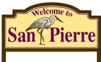
“Welcome to” San Pierre Signs