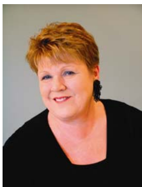
CROPS Executive Director