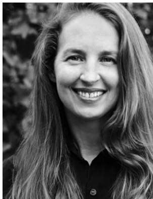
CROPS' Youth Director